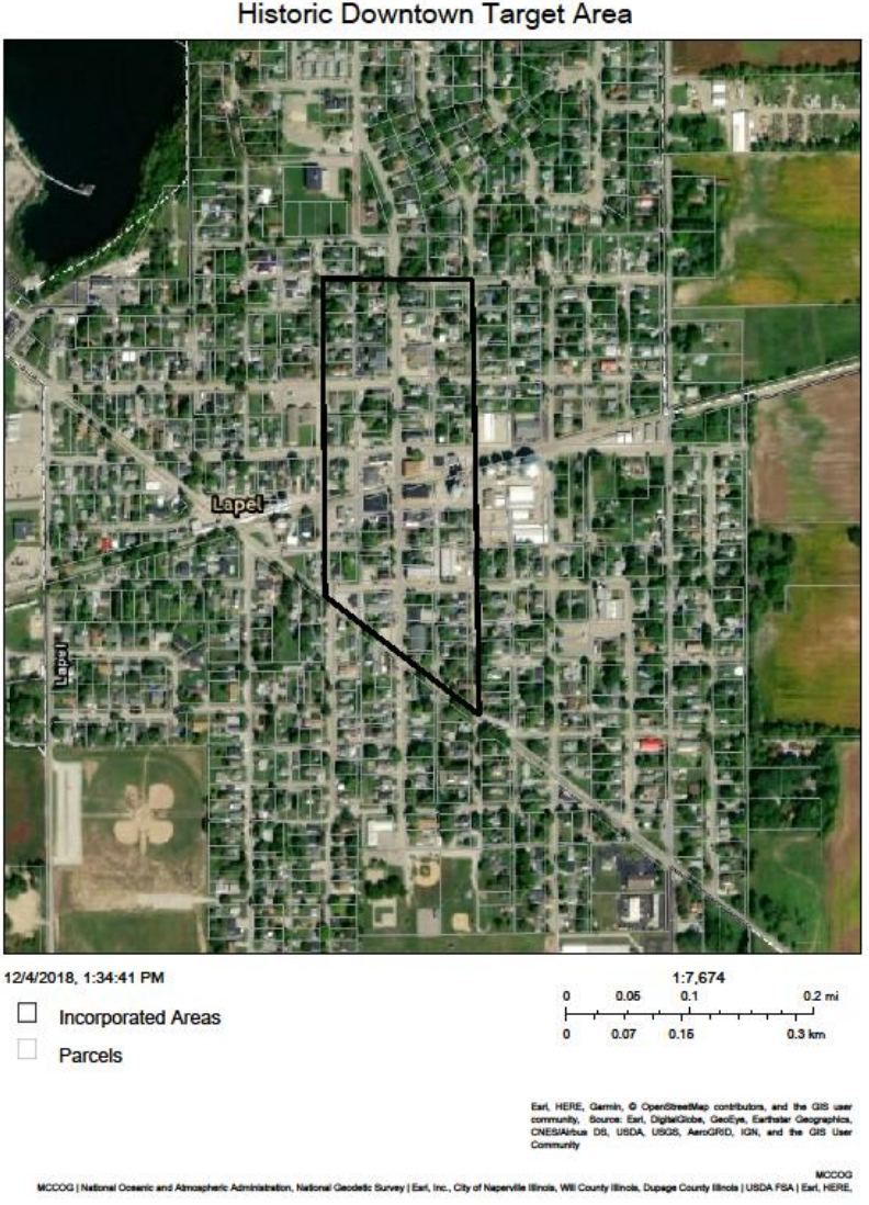
Historic Downtown Target Area

Note: The designation of "ED Target Areas" is informal, and are intended to serve as a general depiction of an area of interest, rather than having specified boundaries (with an 'inside' and an 'outside'). This informal designation is therefore to be interpreted as having flexible boundaries which could include consideration of parcels located generally within an area informally considered to be the 'historic downtown' of Lapel.